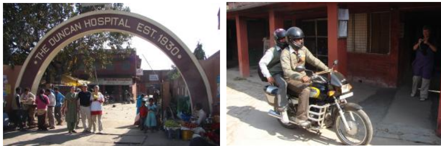
Pictures: Left - Hospital entrance; Right - Two field workers leaving for community visits

"Duncan" exists in the centre of Raxaul. It is a huge Christian compound containing a 200-bed hospital serving all aspects of medical and dental care along with countless offices, a school for 600 children, chapel which seats about 150, apartments for medical personnel along with accommodations for visitors like us plus a bank and courtyard for visiting families. The buildings are old; the hospital wards contain iron beds and are very plain. Of note are three abandoned children living in one room but loved and cared for.