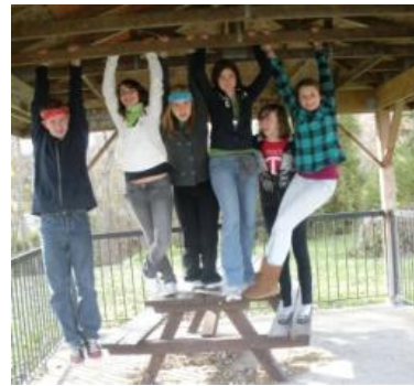
Halloween for Hunger