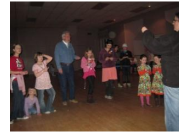
Wake a Thon